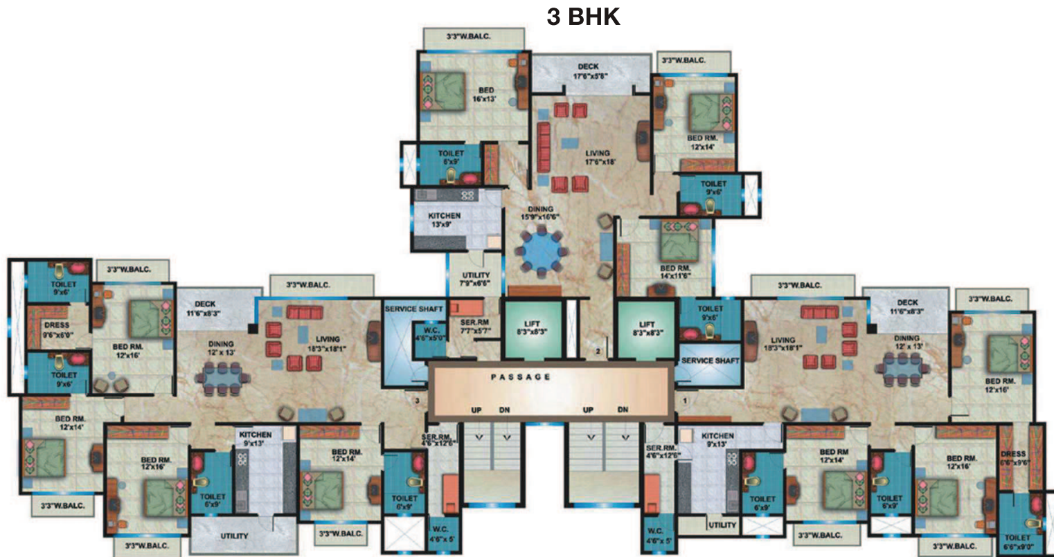
4 BHK (3000 Sq. Ft. Or 278.71 Sq Mtrs)